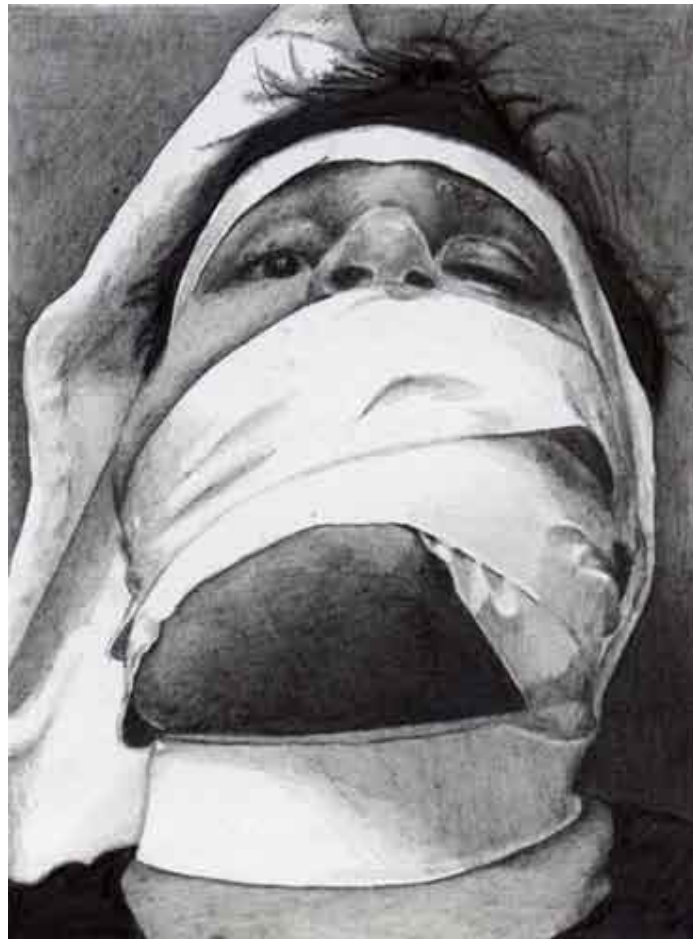
Dane Patterson , Untitled (quiet) , 2005, graphite on paper, 27.9 x 23 cm